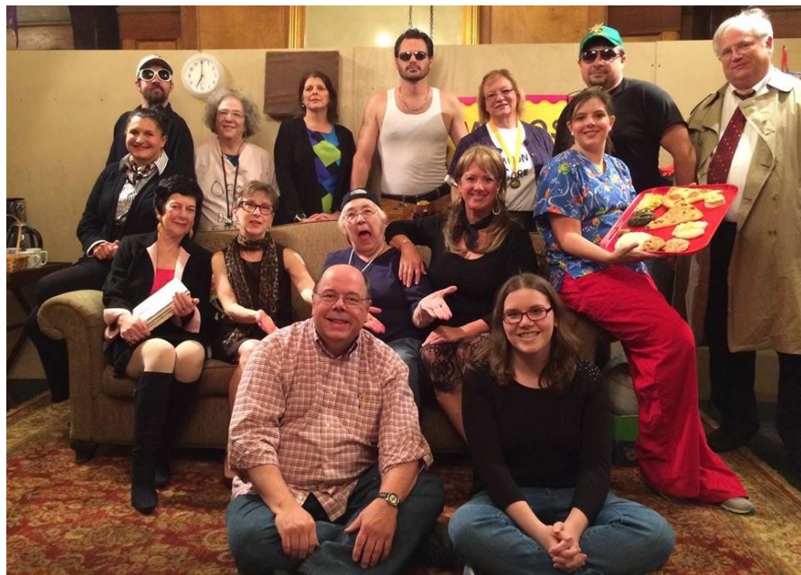
2014 Murder Mystery Dinner Theatre Cast and Crew