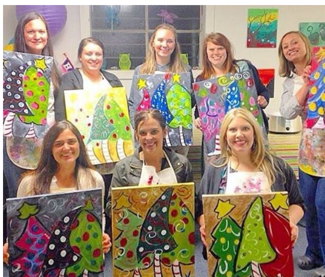
JLAC Board of Directors with their custom Christmas paintings 2014 Christmas Party at Growing Trends in Anniston

Happy New Year!! Time is flying fast, can you believe we are already half way through this League year? This is just a friendly reminder for opportunities to complete Done in a Days, project and meeting requirements. Remember active members are required to complete 2 DIADs and either the Fall or Spring project along with 5 out of 7 general membership meetings. The upcoming DIADs will be a $25.00 donation to Weaver Elementary GOTCHA program and a work day at Weaver Elementary School. The Spring Project will be a Kids in the Kitchen event at Noble Street Festival on March 28. After January's general membership meeting we will only have 3 general membership meetings left and our Annual Meeting (May Dinner). I look forward to seeing you all at the membership meetings, the DIADs and our Spring Project. You will also not want to miss out on our end of the year wrap up at our Annual Meeting. It is always a special night!