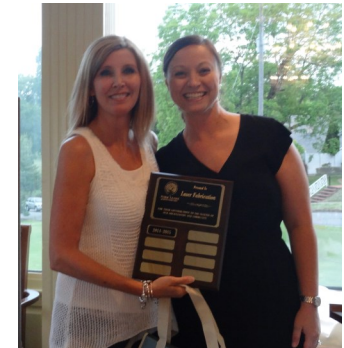
Community Partner Recognition Laser Fabrication