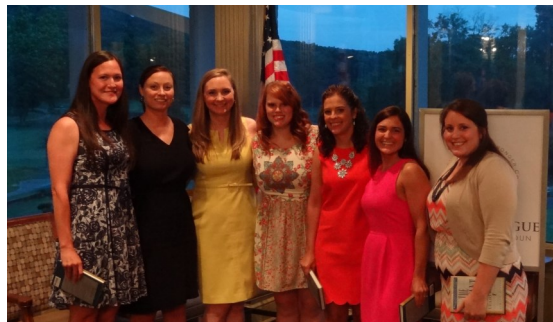
2014-2015 Outgoing Board of Directors