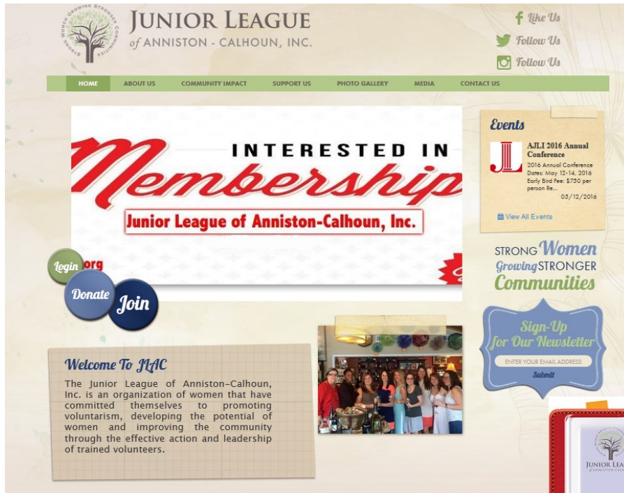
The new JLAC Website

Our Marketing Committee has been hard at work this year to increase our branding and awareness for our League. An updated newsletter, League Lines, was developed and sent to Membership, Community Partners, and Friends of the League monthly. In July a redesigned website was launched to better reflect who we are as a League. Check it out at www.jlanniston.org . We also joined Instagram and Twitter this year so be sure to follow us @jlanniston for updates and news!