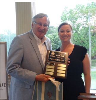
Community Partner Recognition F & M Bank